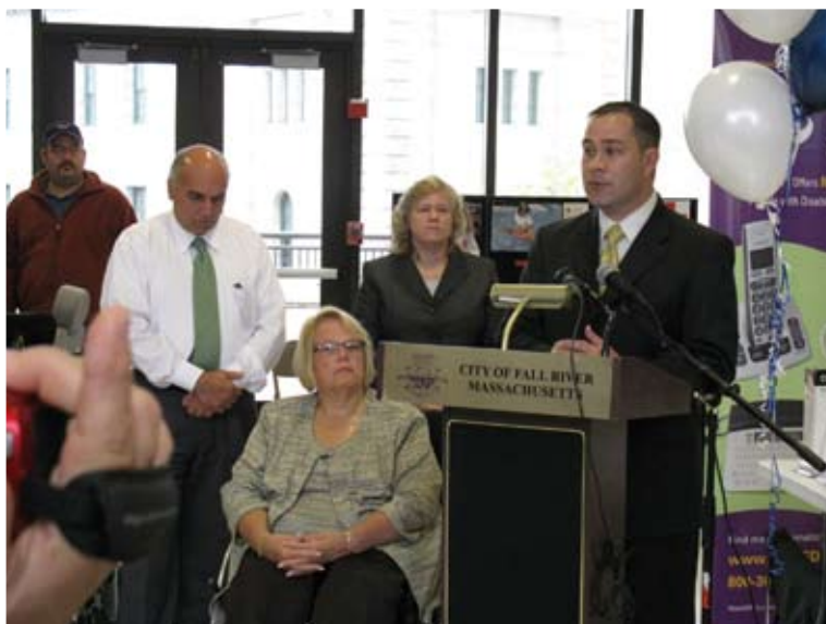
Disability Awareness Day at Government Center.