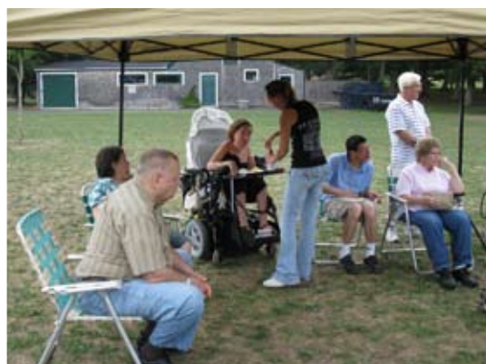
Enjoying our ADA Anniversary Picnic Celebration at Buttonwood Park.