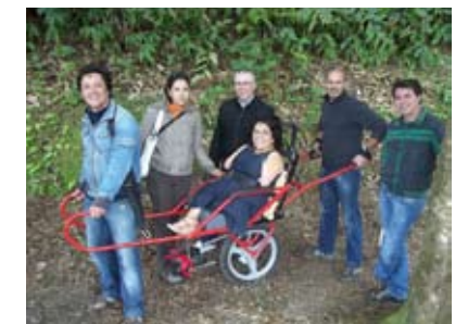
But getting around the islands is made easier with technology and the help of some friends.