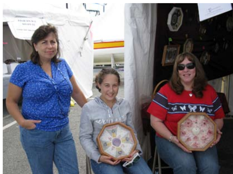
SCIL at the Working Waterfront Festival with our display of Sailor Valentines.