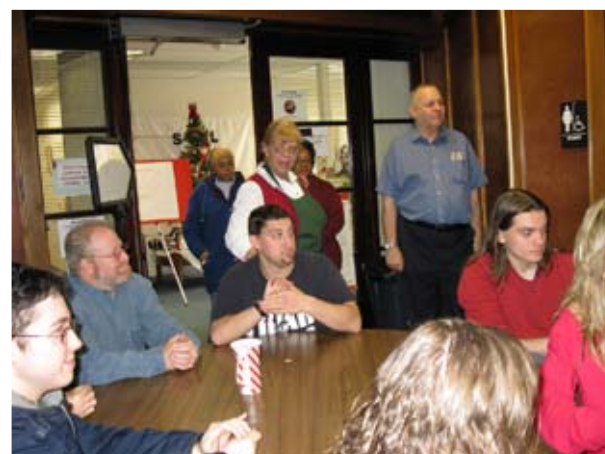
Staff and consumers enjoying our Christmas party at SCIL.