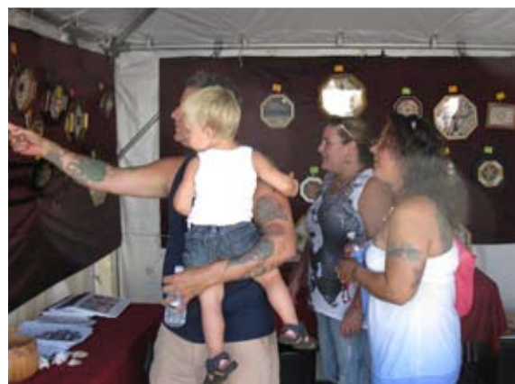
SCIL's first showing of our Sailor Valentines at the Narrows Center for the Arts Festival.